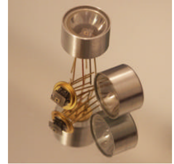
Main thermocooler parameters (without load)